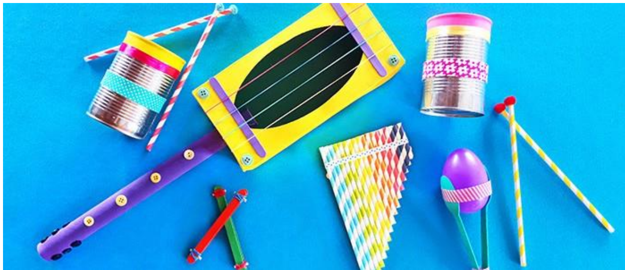
5 instruments kids can make | Good Food

Make musical instruments out of craft supplies and everyday objects. Then experiment with playing the instruments, taking turns and discussing the sounds they make. In ELEPHANT & PIGGIE'S WE ARE IN A PLAY! , Piggie plays her trumpet to sound like an elephant. Do any of the instruments you made sound like animals?